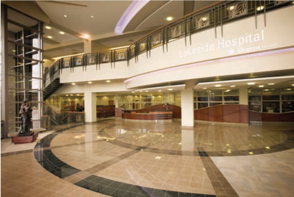
Alegent's Lakeside Hospital in Omaha, Nebraska.

Alegent Health is the largest not-for-profit, faith-based healthcare system in Nebraska and southwestern Iowa. The organization comprises 10 hospitals, more than 100 sites of service, over 1,300 physicians on its medical staff and 9,000 employees.