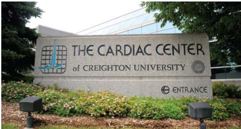
The Cardiac Center is one of many facilities where Creighton Medical Associates provides care to patients in the Omaha metro area.

FBG provides cleaning services for six Creighton Family Medicine clinics and two Obstetrics/Gynecology clinics throughout the greater Omaha area, plus the Emergency Medical Services facility and Creighton Cardiac Center located on the University's downtown campus.